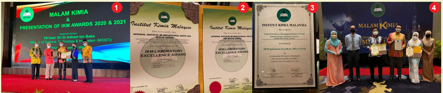
3 Disember, BTS Hotel KL: National Institute of Occupational Safety and Health (NIOSH) sekali lagi merangkul beberapa anugerah di Malam Kimia 2020 & 2021 anjuran Institut Kimia Malaysia (IKM).