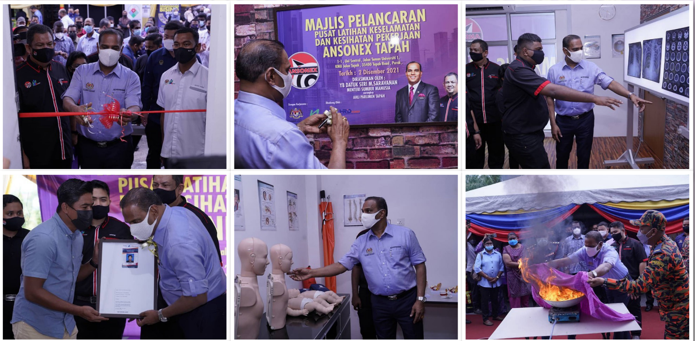
2 Disember 2021 - Datuk Seri M. Saravanan, Menteri di Kementerian Sumber Manusia telah merasmikan Ansonex Malaysia Employment Safety Centre dengan kerjasama National Institute of Occupational Safety and Health (NIOSH) di Taphah.