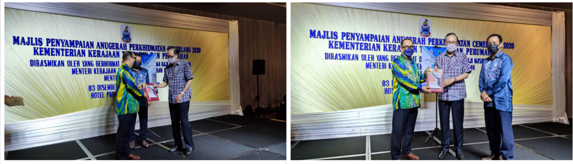
Sempena Majlis Penyampaian Anugerah Perkhidmatan Cemerlang 2020 Kementerian Kerajaan Tempatan dan Perumahan (KKTP) Sabah.