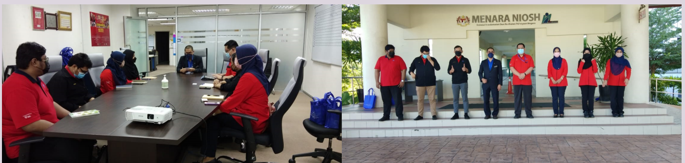
Lawatan Malaysia Transformer (anak syarikat TNB) ke NIOSH Bangi pada 21 Disember 2021